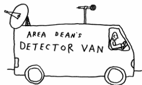
FOUL LANGUAGE ANYWHERE IN THE DEANERY