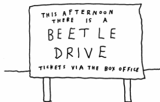
HAVING TOO MUCH FUN