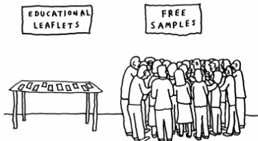
PARISH BREWERY TRIPS